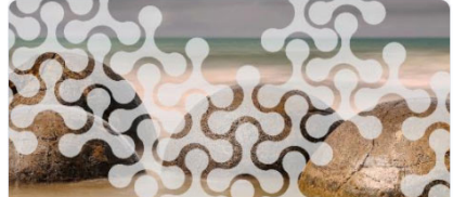
Tō Kupenga – Te Ara Hou

As ākonga get closer to NCEA levels, some may also be enrolled in 000 courses. The 000 courses do not carry NCEA credits. They are foundation courses that lead towards NCEA.