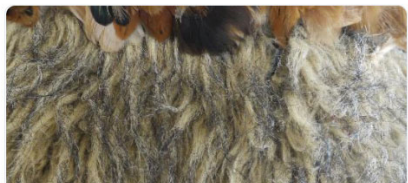
My Korowai/My Profile - Te Ara Tipu