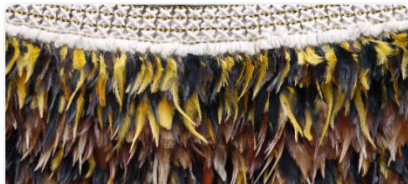
My Korowai/My Profile - OS

My Korowai is a Te Kura designed platform that supports ākonga to share, develop and reflect on their learning.