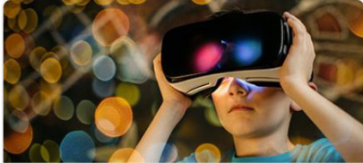
Te Ara Tipu

Ākonga in Years 1–10 are enrolled in Te Ara Tipu (Years 1–6) or Tō Kupenga – Te Ara Hou (Years 7–10).