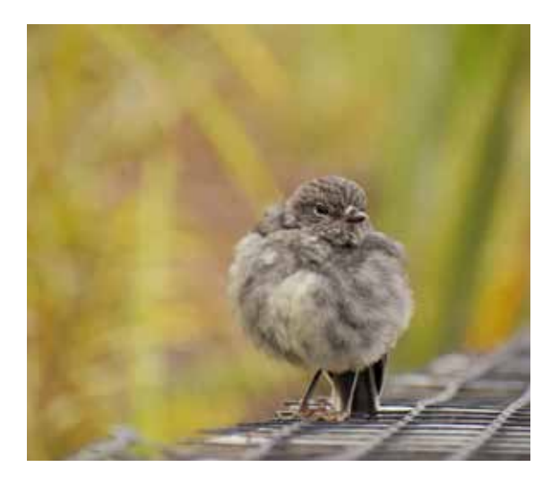
A Toutouwai/North Island robin on Kāpiti Island during my time working there