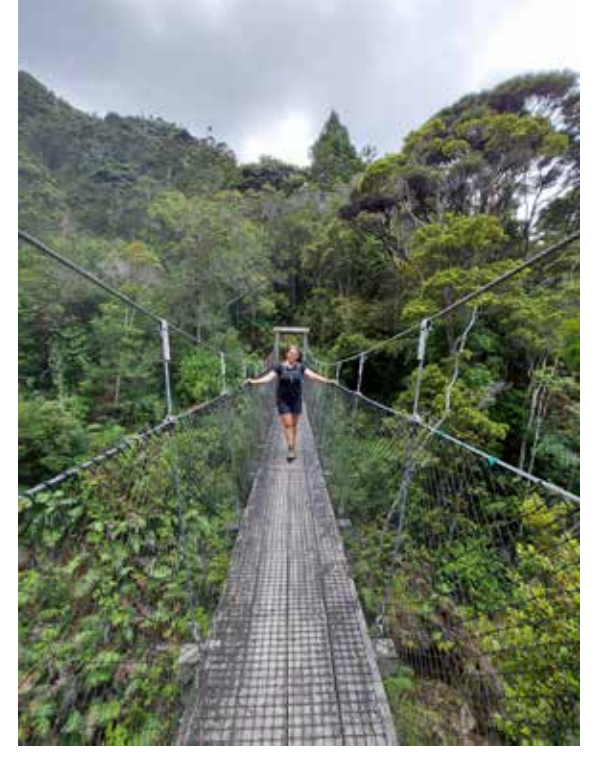
On a swing bridge during a walk on Aotea/Great Barrier Island while I was working there over the summer