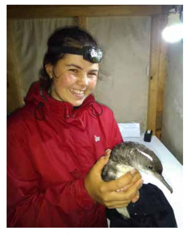
Holding an adult fluttering shearwater during my time working as a summer ranger on Matiu/Somes Island

A flock of tōrea/South Island pied oystercatchers at Pūkorokoro/Miranda