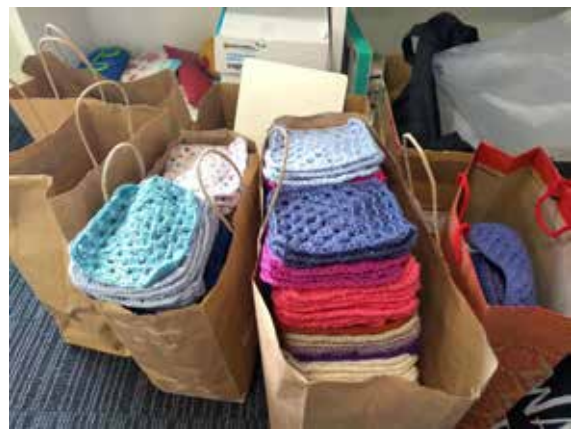
A rainbow of peggy squares

In the end, more than 300 squares were produced, resulting in 10 woollen buggy blankets. Shirley-Anne says the team is now looking to donate the blankets to teen parent units and neo-natal wards.