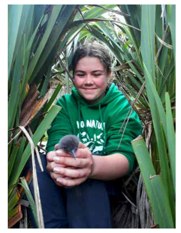
Holding a fluttering shearwater chick during my time working as a summer ranger on Matiu/Somes Island

I plan to continue my volunteer work, move on to tertiary education, start working and saving, and travel overseas.